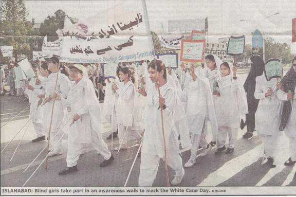
ISLAMABAD: Blind girls take part in an awareness walk to mark the White Cane Day. ONLINE

DAWN Islamabad, THURSDAY, OCTOBER 15, 2009