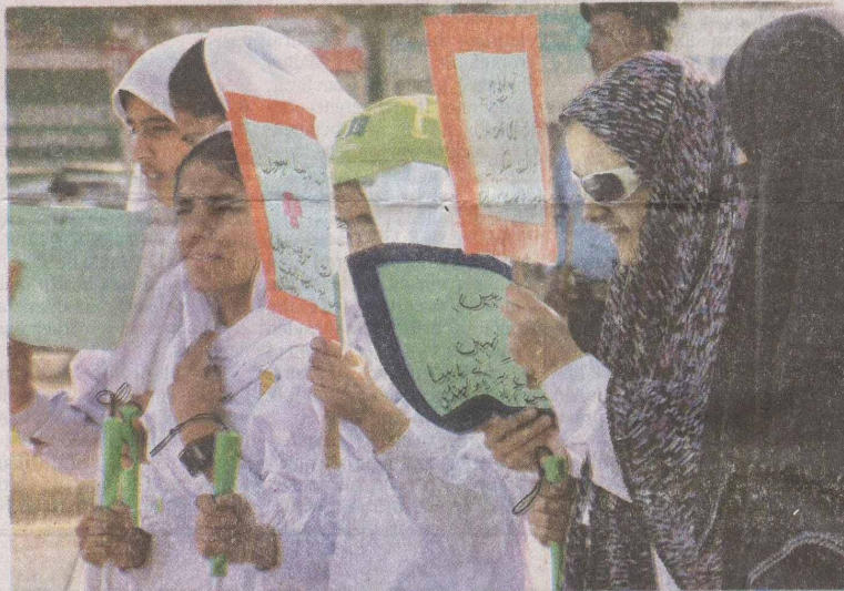
ISLAMABAD: Participants of an awareness walk at Jinnah Avenue.

"The growth and success of the disability movement, which has been well-recognised internationally nowadays, is largely