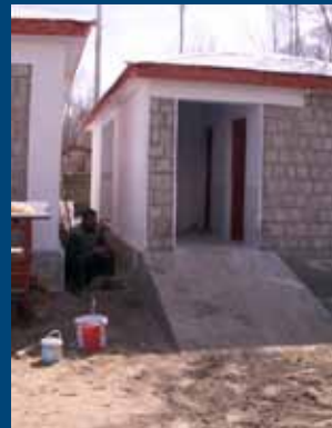
Construction stages: multi-purpose hall, classroom, standard and barriers-free washrooms, veranda, winter view of the construction in progress